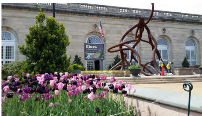
The United States Botanic Garden