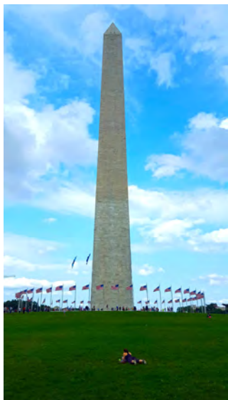
The National Monument

on the once-grassy lawn which extends from the Lincoln Memorial to the U.S. Capitol Building. In response, the National Park Service has just completed a massive restoration project. The turf restoration project was designed to create a healthy and water efficient landscape. All aspects of this restoration will be discussed on our tour by a representative from the National Park Service.