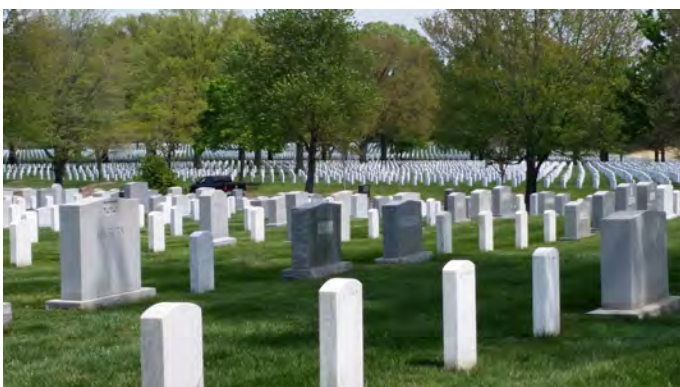
Arlington National Cemetery