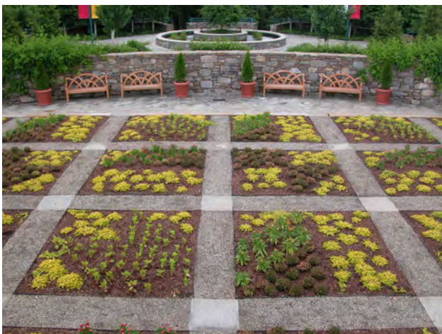
The Gardens at Biltmore Estate